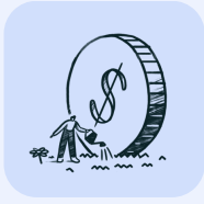
Swag Spend account